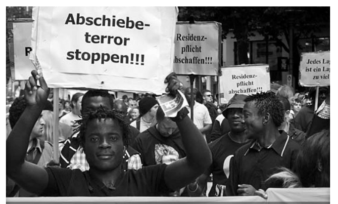
demonstration in Hamburg on the 16th of August 2008

Refugee and migration-related struggles in Germany have never been mass mobilisations. Nonetheless, everyday somewhere in Germany there is resistance against deportations, or refugees protest against the dehumanising conditions in camps. A wide spectrum of antiracist networks is active on various levels, in part for more than 10 years now (for example No One Is Illegal groups or the Caravan for the Rights of Refugees and Migrants). "Manifold but divided" could be an adequate characterisation. Given that the migration-related movement has not really been able to bundle its potential and come together at least in specific campaigns and mobilisations, it has failed to create a broader dynamic within society. However, In the last few years, a few groups have made first attemtps to link migration issues to labour issues and to connect the struggle against illegalisation and deportations with other political social conflicts. This strategy suceeded last year during the anti-G8-week in Rostock, when 10.000 people joined our demonstration "For Freedom of Movement and Equal Rights" on June 4th. Another initiative, the "Initiative for Global Social Rights", brings together left-wing union activists and a variety of NGOs and follows the same intention namely to create more cross-over debates and projects, where freedom of movement is one of the fundamental demands.